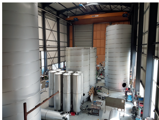
Production in the factory

The lower section of the tank contains the installation room. This is where pipeline installation, water treatment systems, pumps and pressure booster systems with switchgear assemblies can be configured. Access to the installation room is gained via a secured and thermally insulated door. A room air dehumidifier with dew point sensor is installed to prevent condensation on the inner surfaces. The tower has thermal insulation and complete weather-proof panelling on the outside.