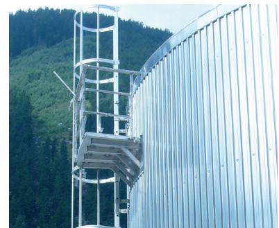
Ladder with roof access

Installation The tanks are installed on a base constructed in accordance with the structural requirements, and fastened permanently and reliably with heavy duty anchors. The floor of the Hydro-SystemTower® is also equipped with thermal insulation so that there are no heat bridges or cold bridges. Only one base has to be constructed when combining multiple towers.