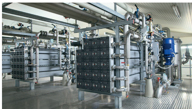
Nanofiltration system for softening and trace substance removal

Besides standard racks, we design application-orientated special systems with many different membranes for almost all applications in water treatment.