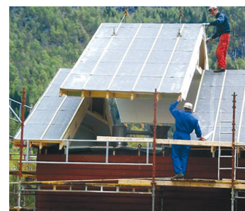
Closing the building roof in Granvin

Groundwater, with low pH and high iron and manganese content, is drawn from two wells in 10 m depth and transported for treatment to the Eide vassverk. The TWK-S 40/23 plant has been in operation since July 2004. The treatment output amounts to 23 m 3 /h.