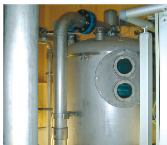
Filter unit in the Gålå Vassverk

The new treatment plant TWK-S 20/13 in the Gålå vassverk has been connected to the network since May 2004. The plant produces 13 to 20 m 3 of high-quality drinking water per hour by natural means from ground water and lake water. The waterworks lies at the Peer Gynt open air stage at the lake.