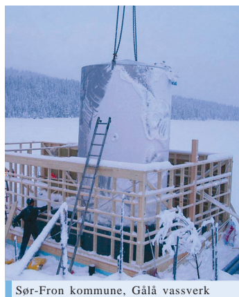
Sør-Fron kommune, Gålå vassverk