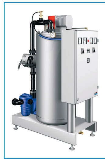
HYDROZON® unit, type P10

Permanent excellent water quality with "feel-well" water can be ensured by the application of the chlorine-free HYDROZON® process technology. A highly efficient oxidation and disinfection is achieved through the integrated ozone stage. The disinfectant hypobromous acid is generated in the process. The plants operate fully automatically and generate a pleasant almost odorless bathing water to make you feel well.