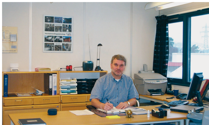
Hydro-Elektrik AS, Office in Bergen

As a consequence, Hydro-Elektrik managed to awaken interest in the new technology, and to obtain and realize first plants. Two plants are already in operation and have been producing highest-quality drinking water since being commissioned. Commissioning of two